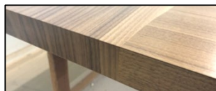
Rio Madera (NO CODE)

The RIO MADERA only offers a live edge river with a waterfall on each end and wood grain on all four sides. There is no separate code necessary for the RIO MADERA edge when quoting or ordering.