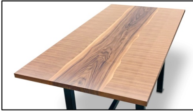
Live Edge Walnut veneer, natural finish, black powder-coated bench base shown