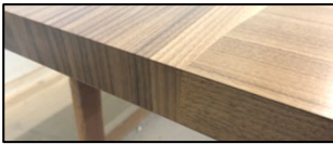
Rio Madara (NO CODE)

The RIO MADERA only offers a live edge river with waterfall on each end and wood grain on all four sides. There is no separate code necessary for the RIO MADERA edge when quoting or ordering.