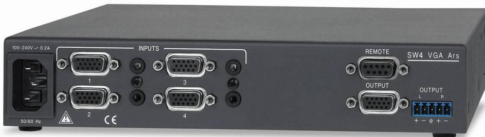
4-user switch box

Step 5: Attach the Switch box to the underside of the top between the cable cubby location and the Backwall (12" in front of the cubby, centered in the top) using the supplied mounting brackets. Make sure that you mount the box with the VGA connections facing away from the side access panel (you should see the on/off switch).