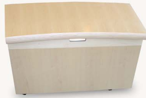
Individual section in setup position

To place your order or get answers to product questions, call 800.242.2443, fax 800.258.5591 or visit nevers.com