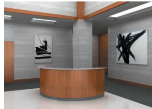
Shown with: - Plain Front Panel - Glass Transaction Top Option