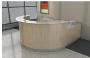
Shown with: - Plain Front Panel - Glass Transaction Top Option