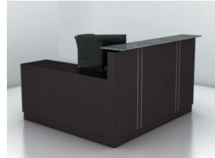
Shown with: - Inlay Front Panel - Stone Transaction Top Option