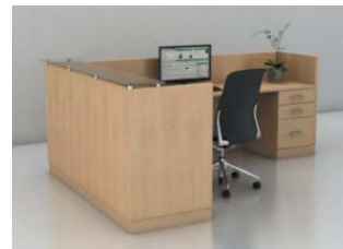
Shown with: - Plain Front Panel - Glass Transaction Top Option