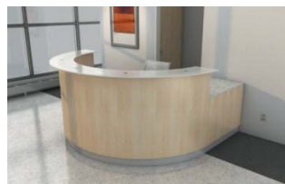
Shown with: - Plain Front Panel - Glass Transaction Top Option