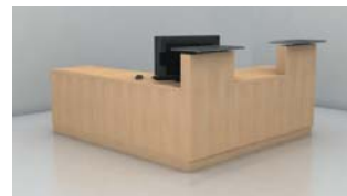
Shown with: - Plain Front Panel - Stone Transaction Top Option