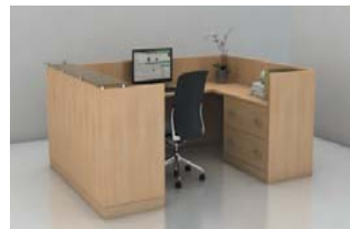
Shown with: - Plain Front Panel - Glass Transaction Top Option